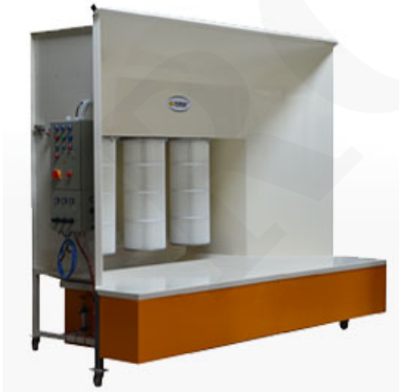
Manual powder cabins