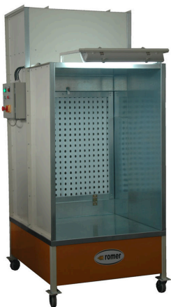
Wet cabins with dry filtration

Frequent colour change, very high painting output