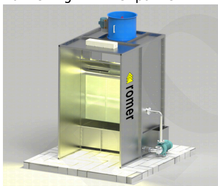
Wet cabins with a water wall