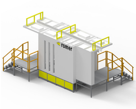
Automatic powder cabins

Frequent colour change, very high painting output