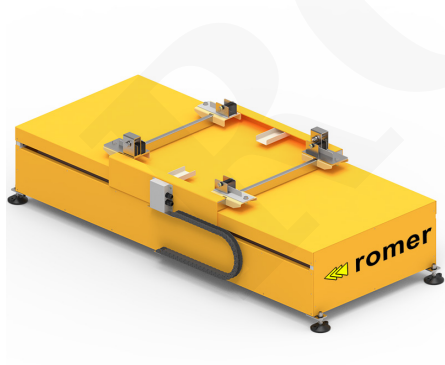
Horizontal X axis of the manipulator