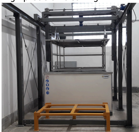
Stripping bathtub system