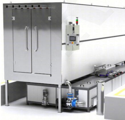
Automatic washes with drying

Minimalizacja migracji Wysoka wydajność mycia