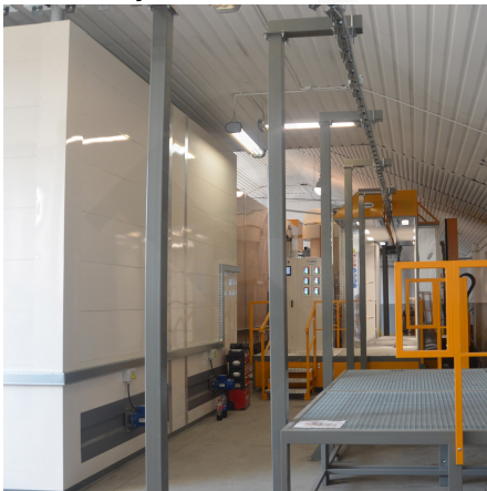
Suspended chain conveyors