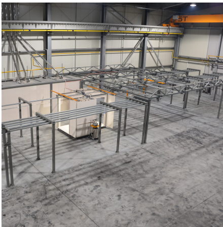
Cross cross traverse