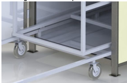
Méthodes de transport

Systemy transportowe do pieców manualnych